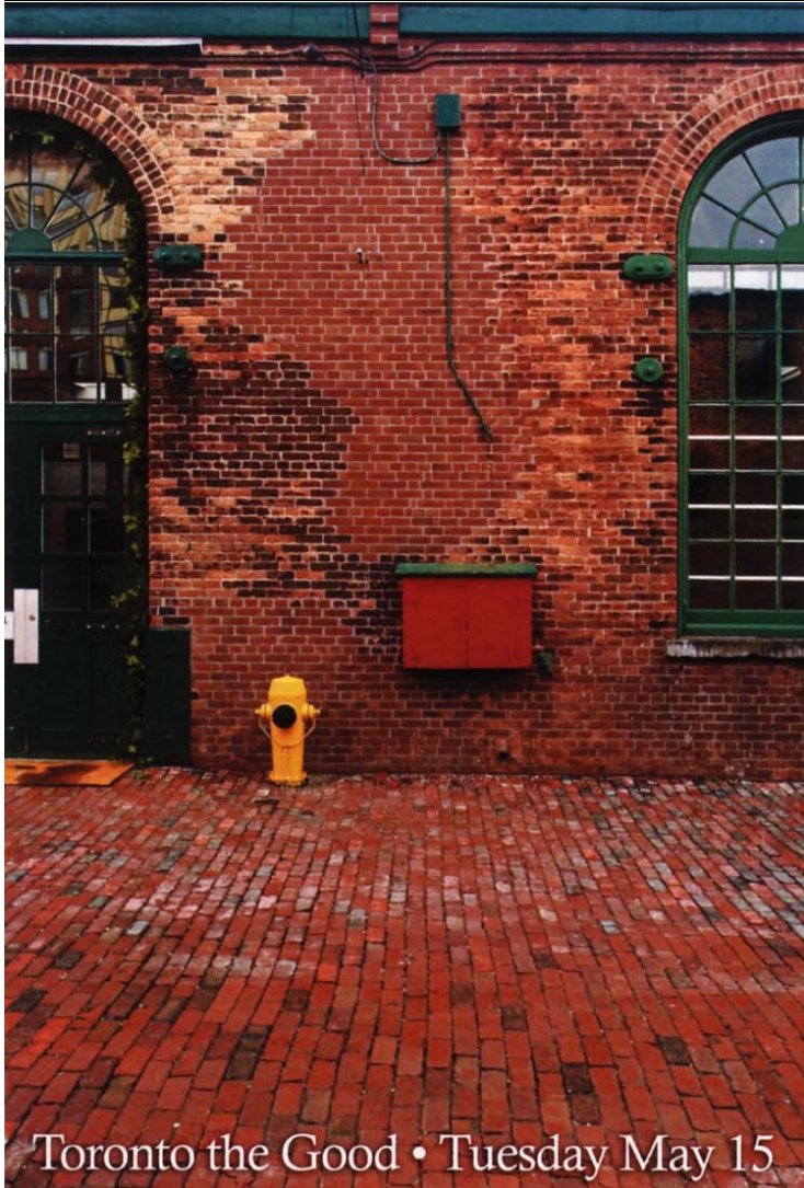
Toronto the Good • Tuesday May 15